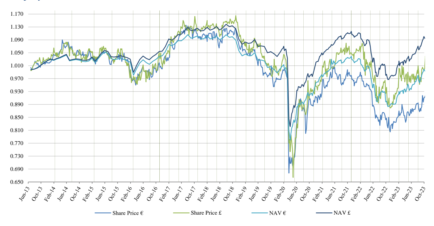
Vertical lines in chart denote periodical dividend distributions. Please reference the table below for historical distribution information.